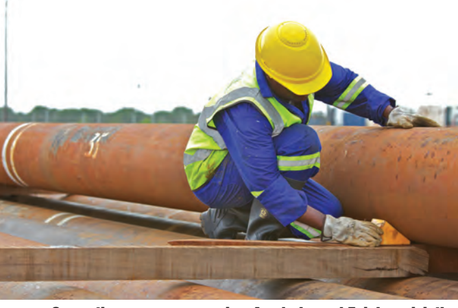
Competing energy companies, Anadarko and Eni, have jointly agreed to develop a LNG Park in northern Mozambique

On completion of the dam – as well as a pumping station, to be located some 13 km downstream – water will flow almost 9 km through a 1,100 mm steel pipe, to reach a reservoir with a capacity of 857 million m<sup>3</sup>. Once the water starts to flow, it is expected to take around two years to fill the reservoir, which will have a surface area of close to 40 km<sup>2</sup>.